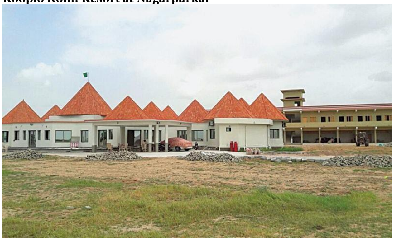
Jain Temples, Nagarparkar